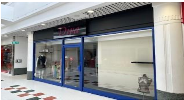
N6 – TO LET