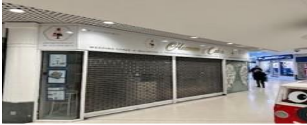
K1 – UNDER/OFFER