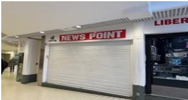
K2- UNDER OFFER